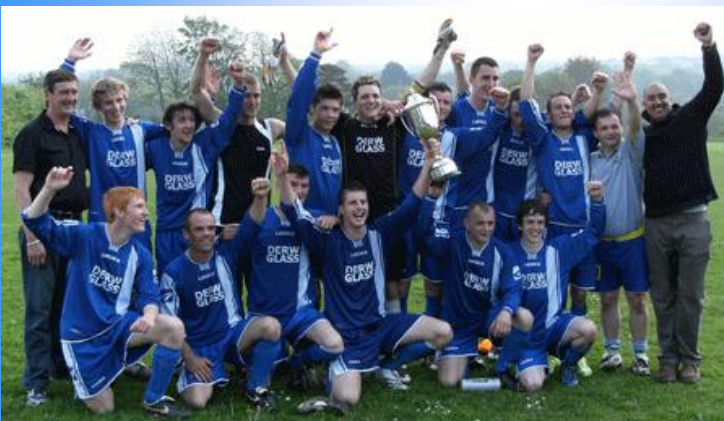
League Champions 2007/2008

The Blues have not hit the dizzy heights since, in 2011/12, the Blues were runners up to a dominant New Quay, and as for the reserves, after being relegated in 2011/12 bounced back to the 2 nd Division.