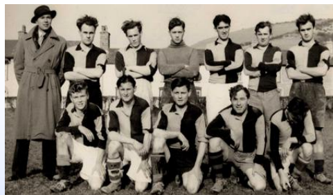
1953/54 Division 1 winners: Aberaeron

It was further decided that the 'Northern Section would comprise all Clubs to the north of Lampeter, excluding Lampeter' and that the 'Southern Section would comprise all clubs to the south of Lampeter, including Lampeter'.